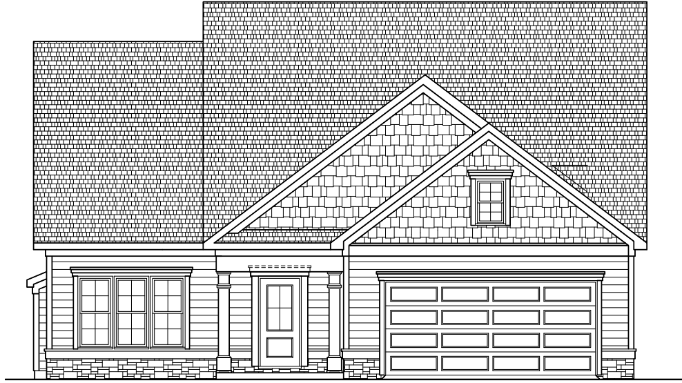
FRONT ELEVATION - A