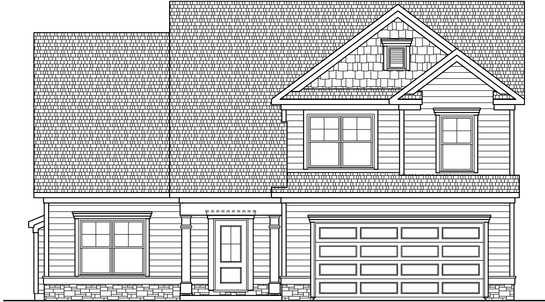
FRONT ELEVATION - B